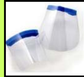
Eyes + nose + mouth