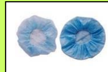
Head + hair