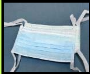
Nose + mouth