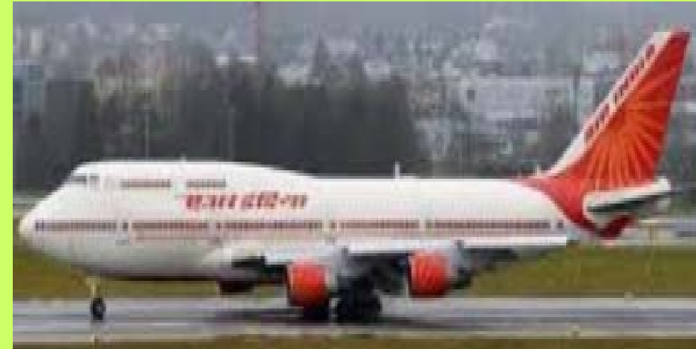
86 Boeing 747