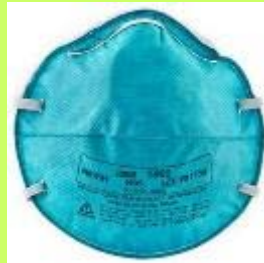
Nose + mouth